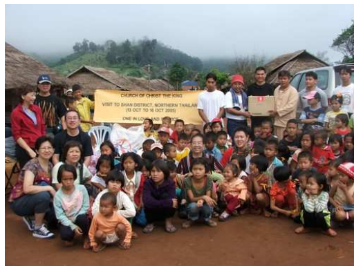
One in Love and Service with the refugees