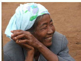
A Shan woman