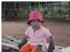
Shan child—How can we not care?

The response received from the parishioners was fantastic!