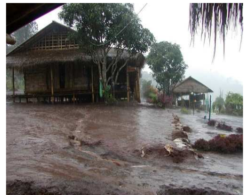
Shan living conditions

Many of the refugees lost their loved ones as a result of the civil war in Burma. Unable to return home, they