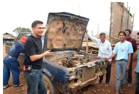
Truck for Emergency use