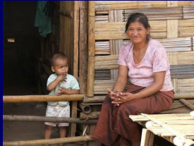
Shan Grandmother and child - What future do they have?

" we spoke to a little girl who lives with her grandmother— her mother had died and the father left them and did not return "