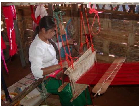
Loom to make cloth for sale

Parishioners were visibly touched by the various presentations, and some were moved to tears. Many were seen bringing their children to view the exhibition and posters put up at the church. They were also very generous, and the funds collected during Advent for the project will be used to :-